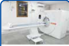
Rotary Rajkot Greater CT Scan Centre at BT Savani Kidney Hospital