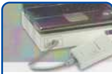
Rotary Rajkot Greater AUDIOMETRY LAB