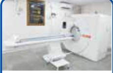
Rotary Rajkot Greater CT Scan Centre at BT Savani Kidney Hospital