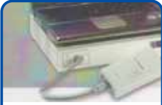
Rotary Rajkot Greater AUDIOMETRY LAB